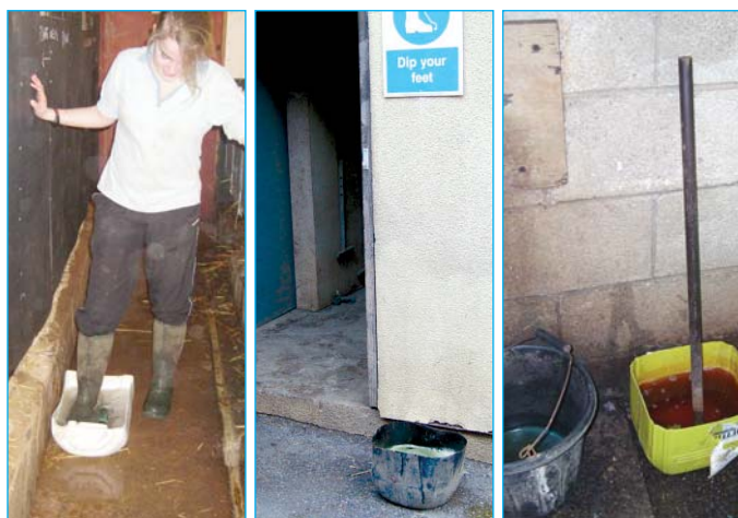
Using footdips will minimise the transfer of disease

While the Agriculture and Horticulture Development Board, operating through its BPEX division, seeks to ensure that the information contained within this document is accurate at the time of printing, no warranty is given in respect thereof and, to the maximum extent permitted by law the Agriculture and Horticulture Development Board accepts no liability for loss, damage or injury howsoever caused (including that caused by negligence) or suffered directly or indirectly in relation to information and opinions contained in or omitted from this document. © 2011 Agriculture and Horticulture Development Board (AHDB). All rights reserved.