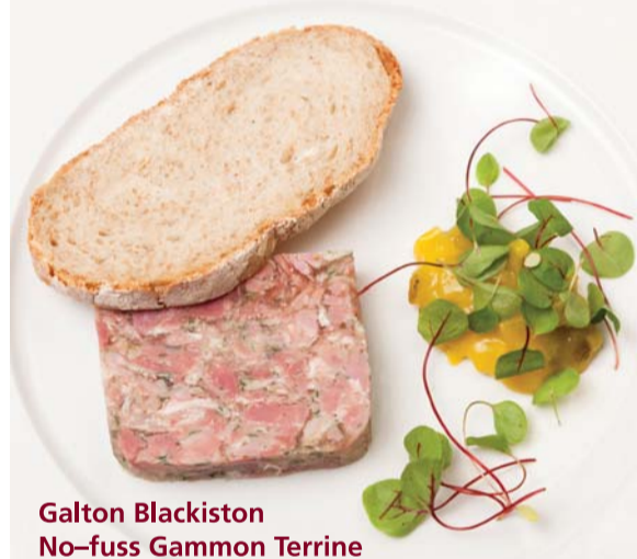
Galton Blackiston No-fuss Gammon Terrine