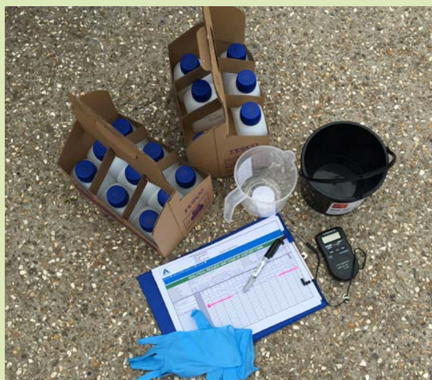
Figure 2. Equipment for water sampling