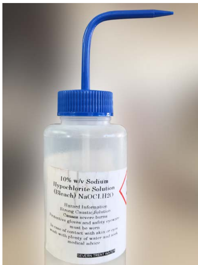
Figure 3. Sodium hypochlorite wash bottle