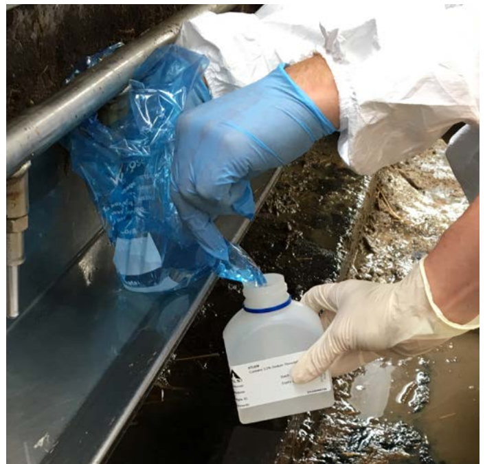
Figure 6. Sampling using clean food bag