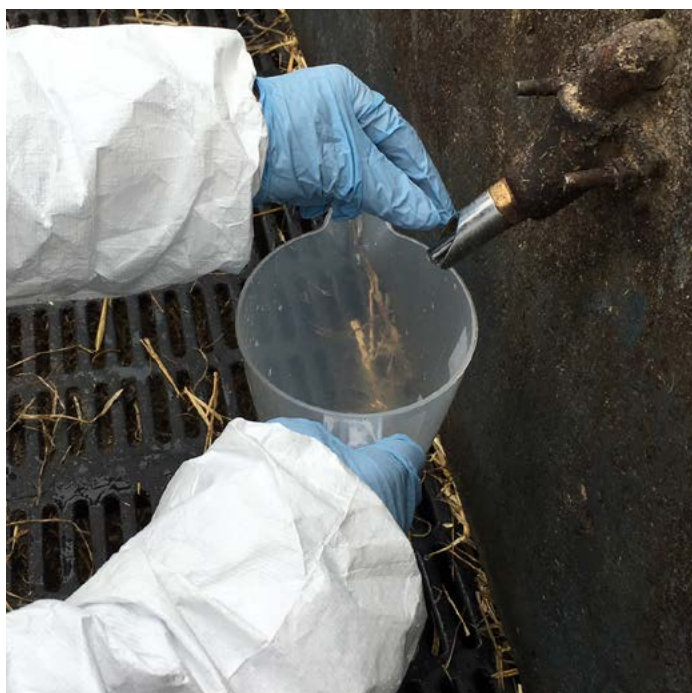
Figure 4. Measuring water flow rate