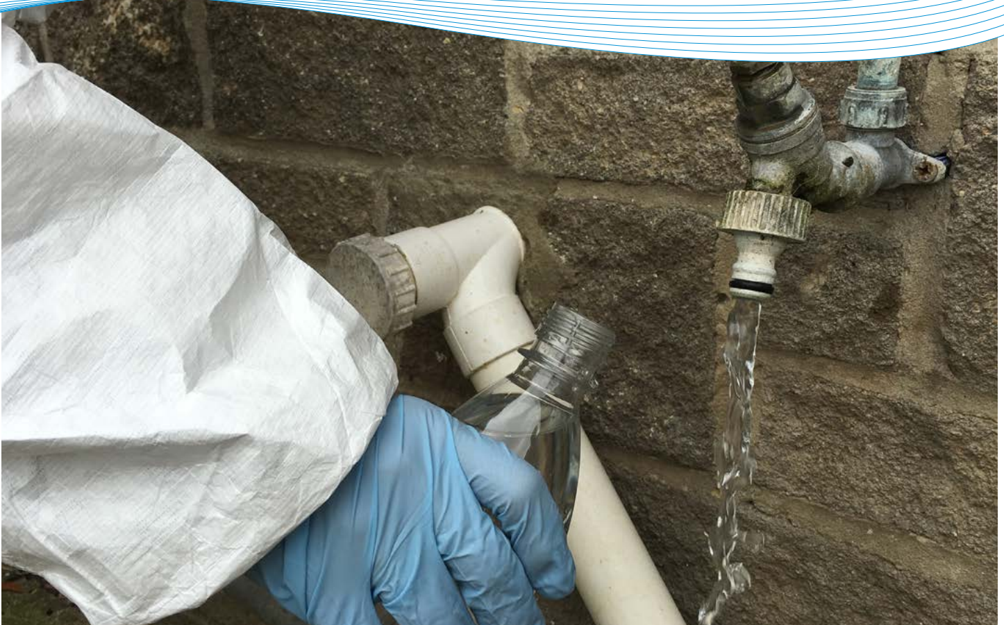
Figure 1. Water sampling from outside tap as nearest point of entry

Read the entire SOP thoroughly before commencing any water sampling.