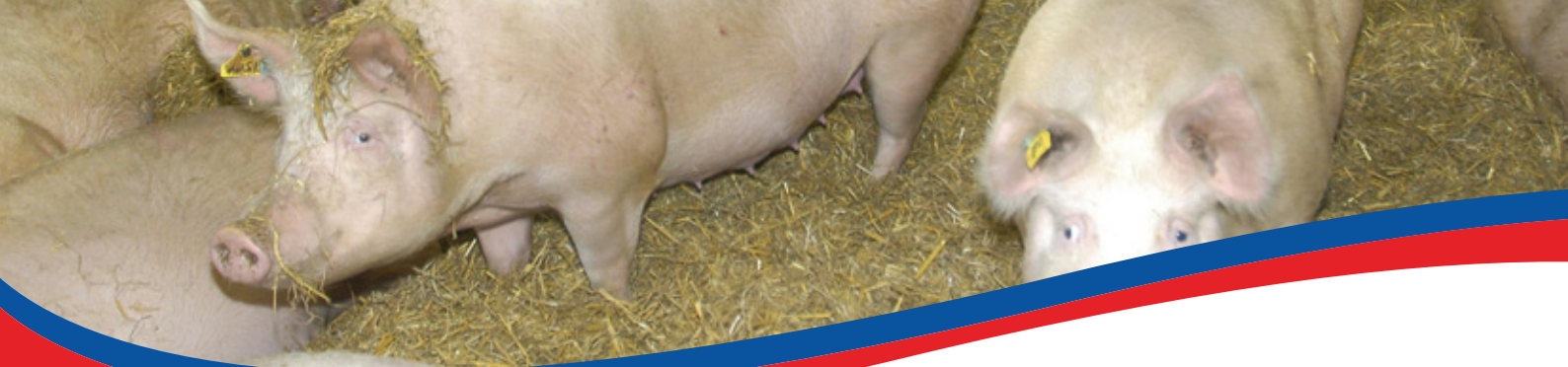
Figure 1: Descriptors to help with your condition scoring