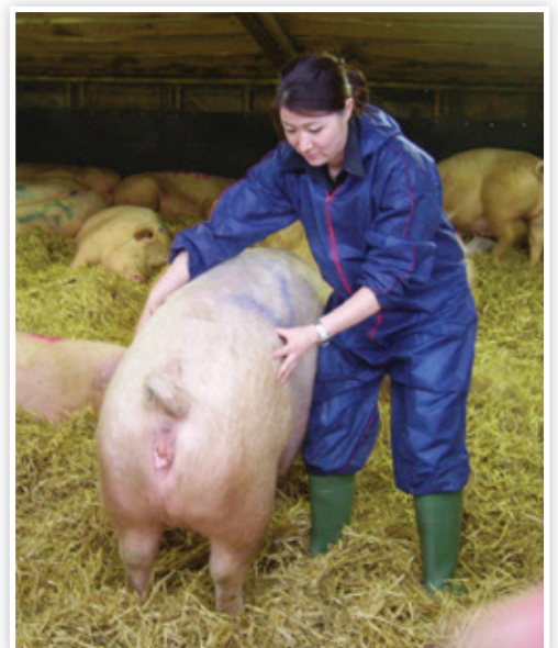
Condition scoring of a sow by touch