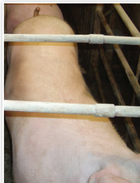
Condition score 3.5