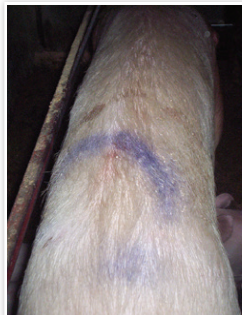
Condition score 2.5