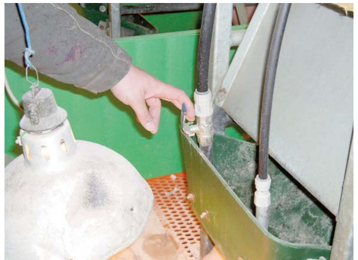
Figure 3 Supplementary water should be provided