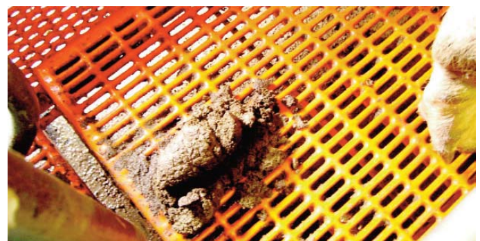
Figure 1 Acceptable faeces should be a glistening well-formed mass that is soft to the touch

Another intervention could be the provision of hessian ropes attached to the gilt's farrowing crate, this is a manipulable material and may alleviate some of the stress the gilt is experiencing.